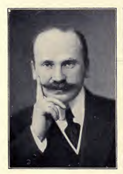
COUNT DIAMANDI Roumanian Minister to Russia