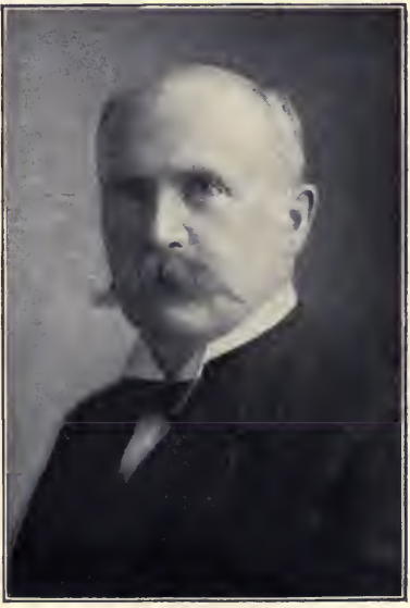
T. NOULENS French Ambassador to Russia