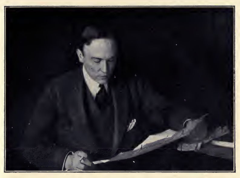
TERESTCHENKO Minister of Finance and later Minister of Foreign Affairs under the First Provisional Government