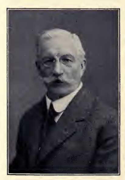
PAUL MILIUKOFF First Minister of Foreign Affairs under the Provisional Government