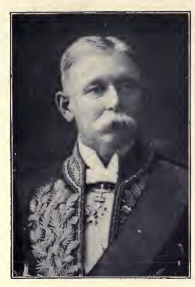
N. PREBENSEN Norwegian Minister to Russia