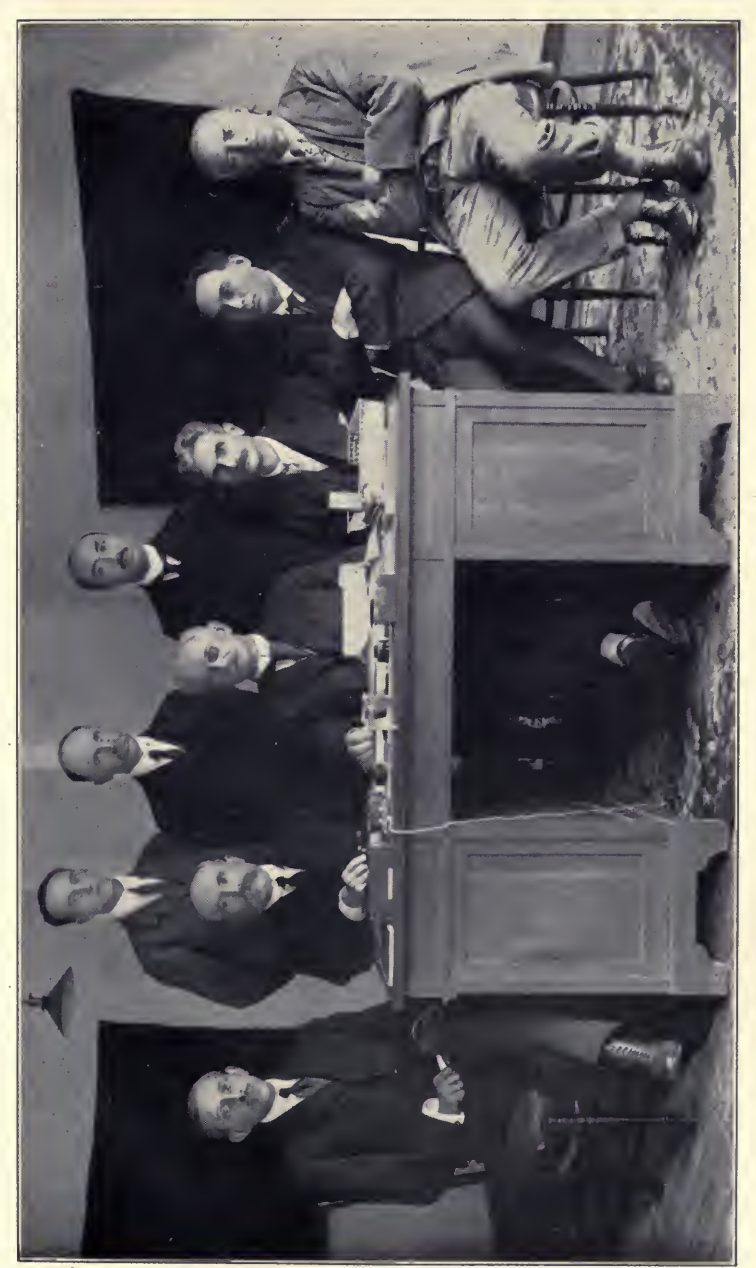
LAST CONFERENCE OF THE ALLIED CHIEFS IN THE AMERICAN EMBASSY, VOLOGDA, JULY 23, 1918